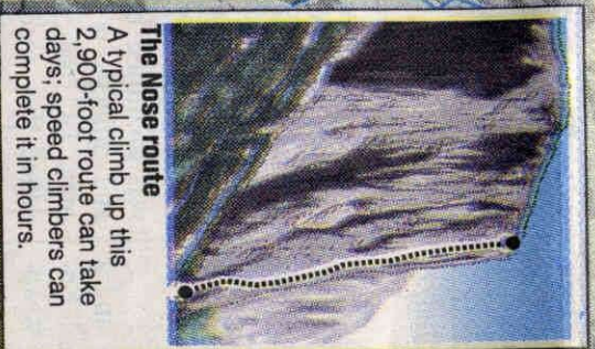
The Nose route A typical climb up this 2,900-foot route can take days; speed climbers can complete it in hours.